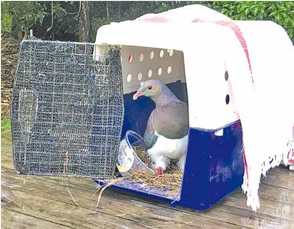
This Geraldine kererū was released in Talbot Forest last Friday following more than a month of hospitalisation.

Project Kererū, a voluntary conservation project, is one of several rehabilitation destinations Geraldine DOC sends birds to. “Depending on the bird and the injury, we might go there, or to the [New Zealand] Raptor