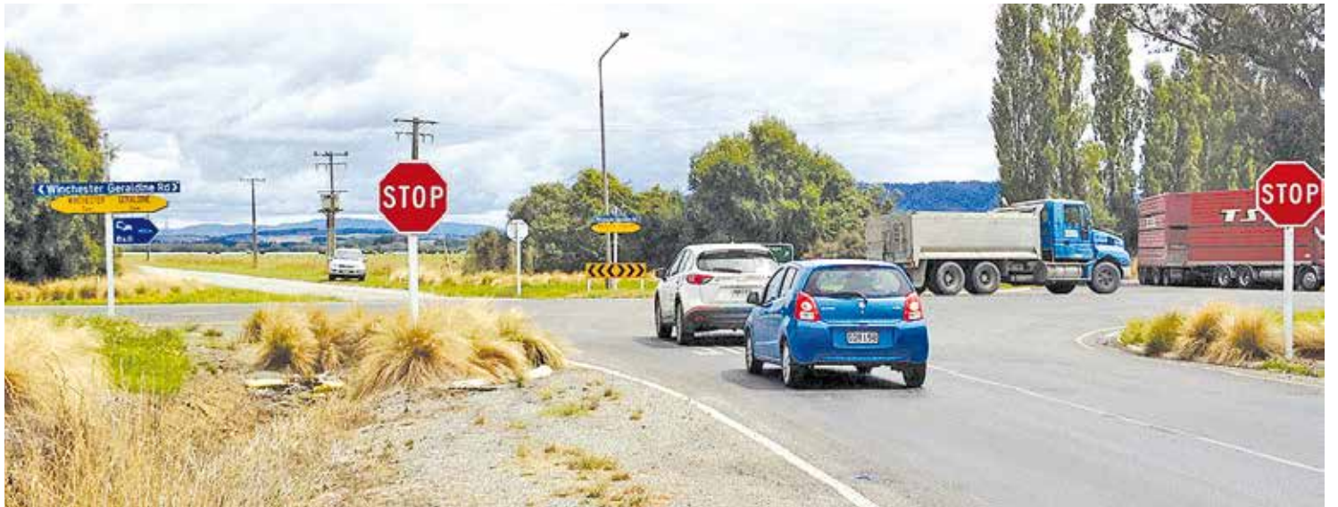
Coach Road is considerably busier due to the increased use of GPS systems for navigating.

Most Geraldine drivers have had a scare at the Coach Road and Tiplady Road intersection on the Winchester-Geraldine Highway.