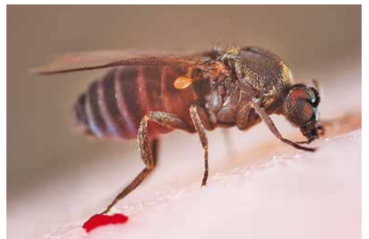
Locals report that sandflies have become more common in the Geraldine area.