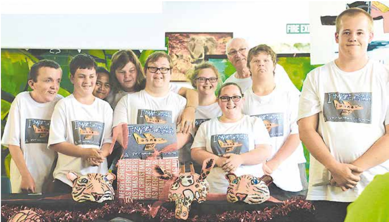
Golden Bay High School students at the launch of their book, I'm Going Home for Christmas.