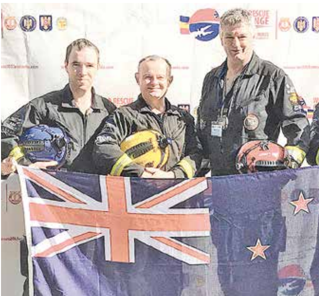
Above: Three of Geraldine’s champion road-crash rescue team which finished 16th out of 34 teams at the world championships in Romania. Representing Australasia and Geraldine meant twelve long months of continual fundraising for five short days of competition. None of this would have been possible without massive support, says the team. Their second placing at the 2017 Australasian competition earlier this year earned them an automatic invitation to the 2018 World Crash Rescue competition in South Africa. “We have accepted the invitation, so we will be hoping for community support again.”