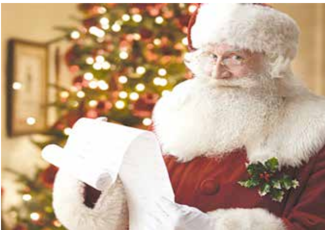
The Geraldine News took some time out of Santa’s busy schedule to see how he and his team were doing. The Geraldine News: How are you getting on at this busy time of year? Are you coping OK? Santa: Oh yes, I’m doing fine but there’s a lot to do. You’ve got no idea how many letters I get from children at this time of the year. I’ve got to take the time to read what they tell me and check out the great drawings and paintings some of them send. Then there’s the really big job of organising all those presents. Thank goodness I get good help. The Geraldine News: Have you got any messages for the children of Geraldine? Santa: Yes, I think it’s an important time of the year to make sure you’re being helpful and thoughtful around your place. Look out for people who are littler than you. Think about doing something nice for someone else. It was lovely to see so many of you at the Santa Parade. Merry Christmas everyone.