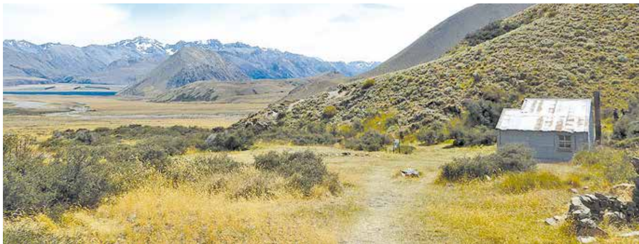
Double Hut at Lake Heron in the Ō Tū Wharekai wetland restoration area. Probably built in the early 1900s, the hut first housed musters; it now plays host to hunters, Te Araroa Trail walkers and people on overnight or day tramps.