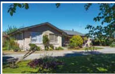
43 Campbell Street, Geraldine