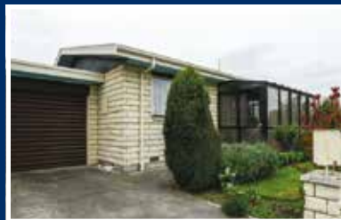
103C Talbot Street, Geraldine