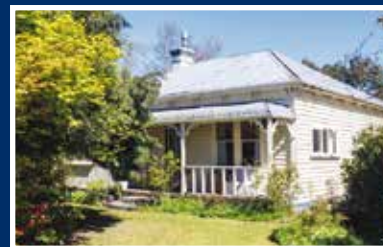
17 Gladstone St South, Orari

Due to high volume sales we need more listings. We have buyers waiting for their dream home.