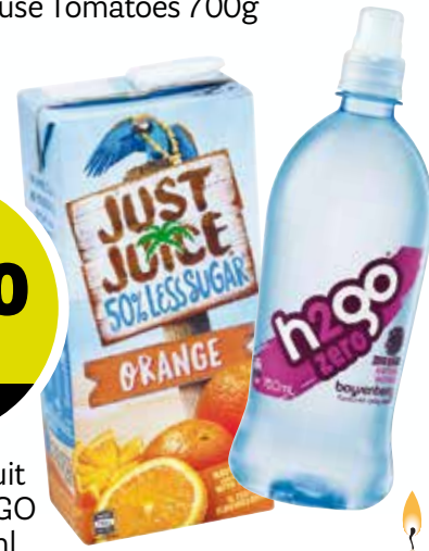
Just Juice Fruit Juice 1L/H2GO Water 750ml