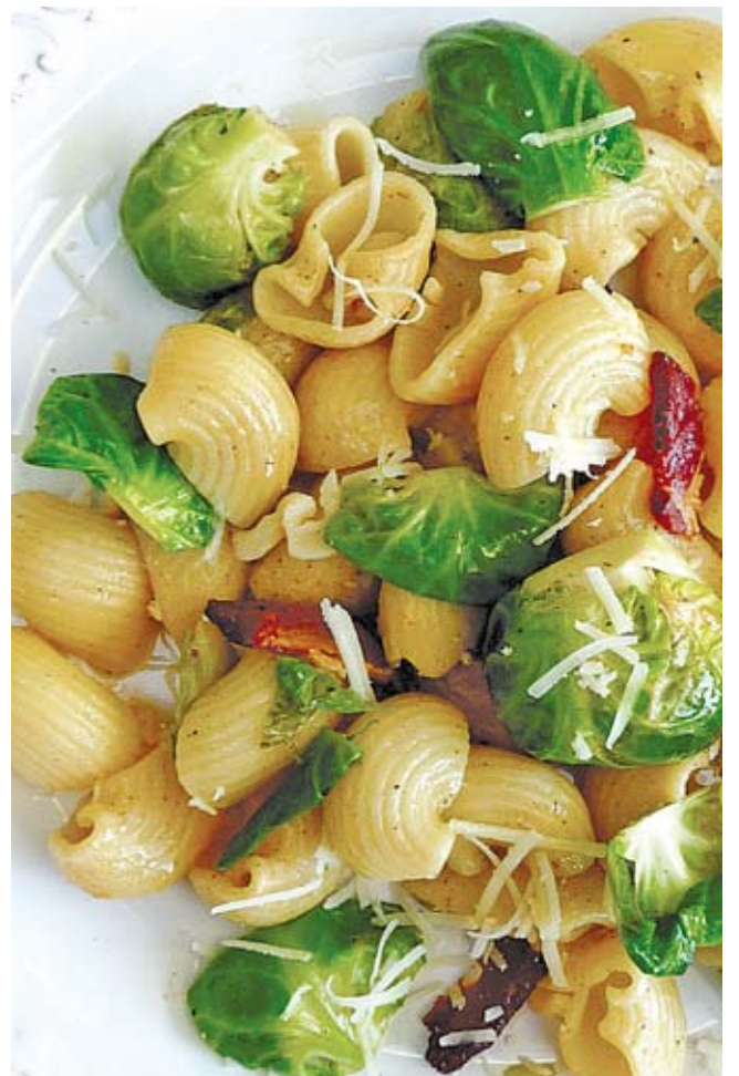
Brussels sprouts finely chopped and pan-fried with butter, garlic, flaky salt and streaky bacon and tossed through pasta.