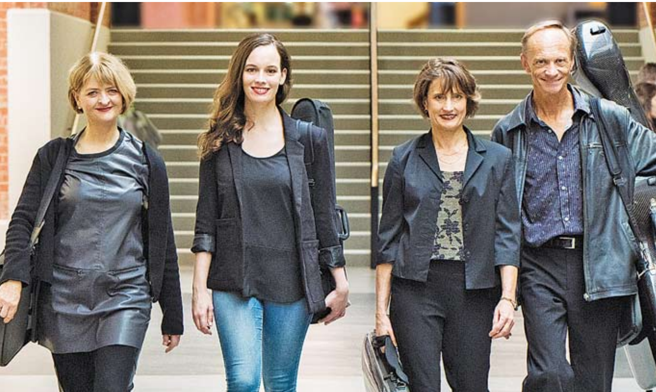
The New Zealand String Quartet will perform in Geraldine on Thursday 18 August.