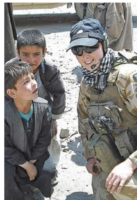
Afghanistan: The Soldiers’ Story , Geraldine Cinema, Sunday 3 July at 2pm.