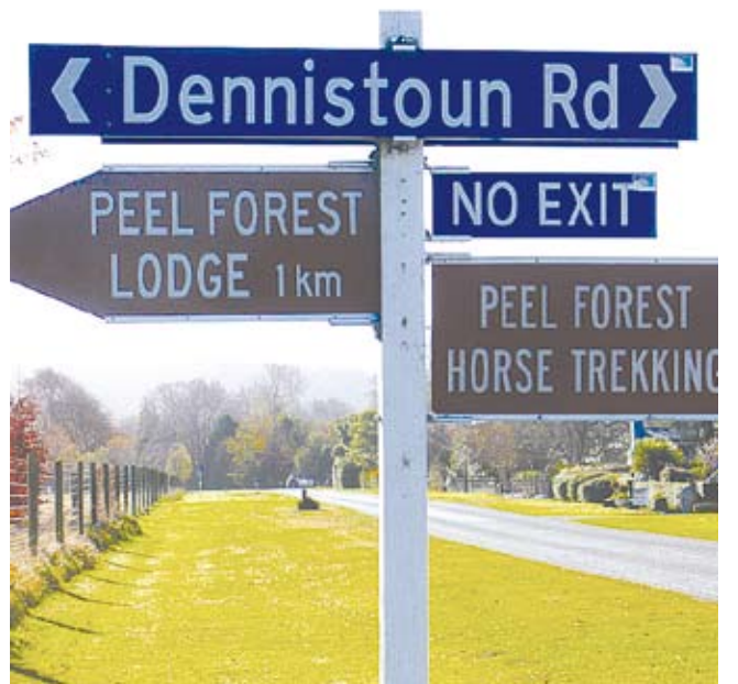
Dennistoun Road in Peel Forest.