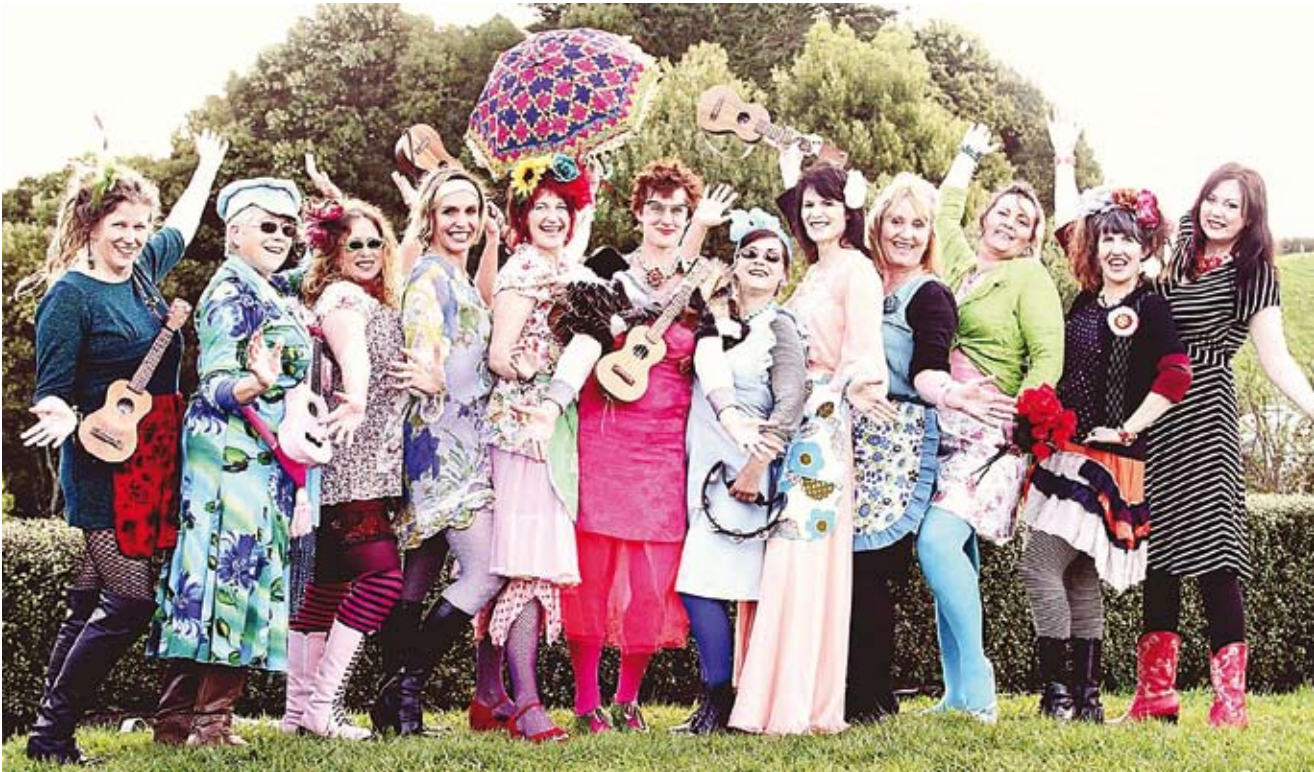
The 12-strong all-girl band The Apron Strings from Te Pahu will set the scene for a blockbuster open-mic session.

Look out for ukuleles in Geraldine this July. Nearly 200 people have registered for the seven workshops, with people coming from all over New Zealand and even from Melbourne. While the 500-seat hall at Geraldine High School will cater for the anticipated 300 or so attending the main concerts, three of the workshops have already sold out.