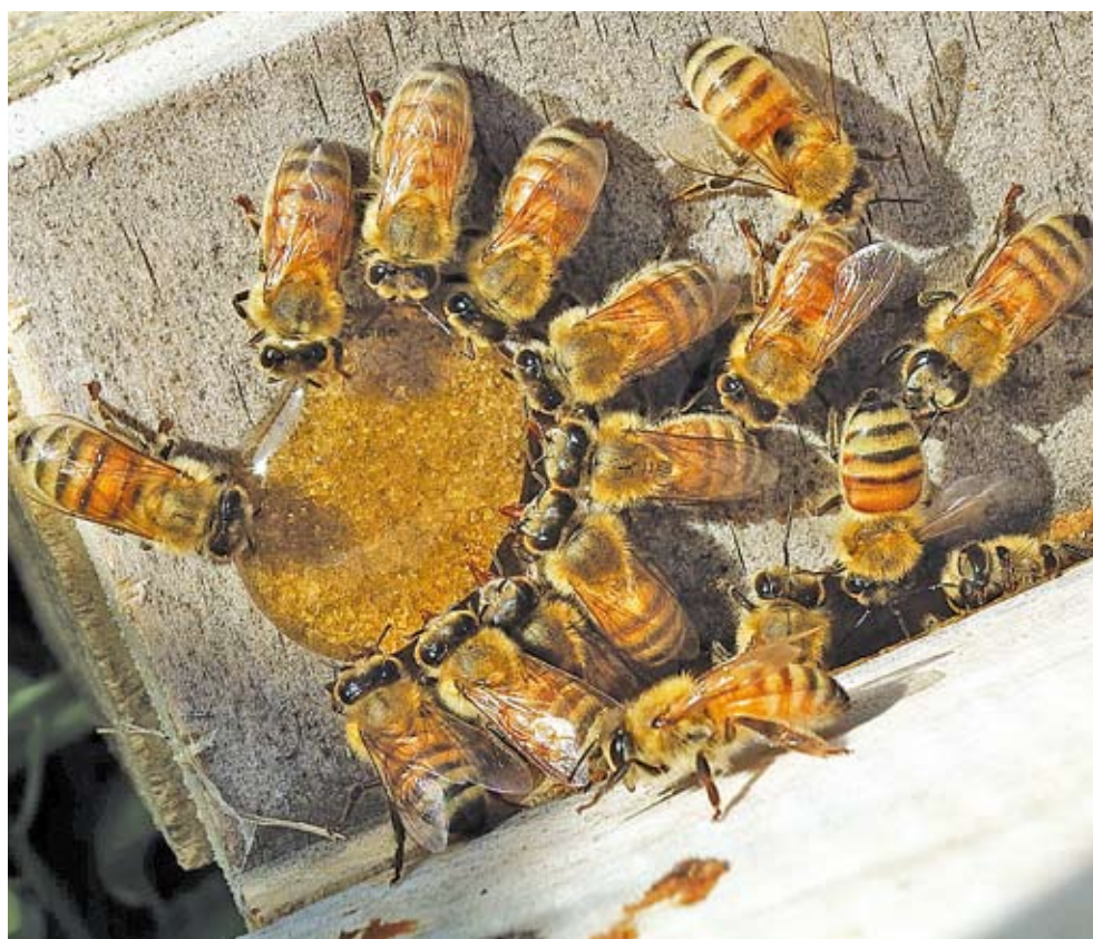
Worker bees enjoying a little sugar syrup. Topping up their feeder with a litre or two of sugar syrup can spur the queen to lay and keep the hive numbers up.

During winter, bee numbers in a hive decrease dramatically; it's a survival mechanism. The fewer bees there are, the fewer mouths to feed – but also the easier to wipe a colony out. Those bees that do live through the winter live for around 140 days (instead of around 45 days). The queen slows her laying right down and on cold days the colony huddles into a tight little cluster around the brood (larvae and pupae) with