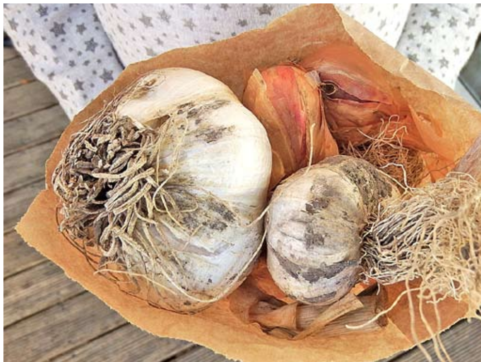
The brown paper bag mentioned in the article, containing alliums ( elephant garlic, shallots and garlic ).

Come spring, don't let the soil dry out as this is vital growth