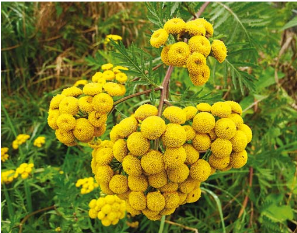
Some trees help water nearby plants with shallower root systems, such as this companion plant Tansy planted beneath an apple tree.

This big old tree is in the first area we planted in a forest-garden fashion. Where there was grass surrounding the tree, we replaced it with berries, herbs, garlic, comfrey and other plants to act as companions and nutrient accumulators. They all nestled under the tree with some extending past the dripline. I didn't try to control their growth, I let them roam free. It would take some time, but I knew I was creating a resilient system. It wasn't until I watched how this little ecosystem changed, that I began to see the resilience I'd created and explore the reasons why.