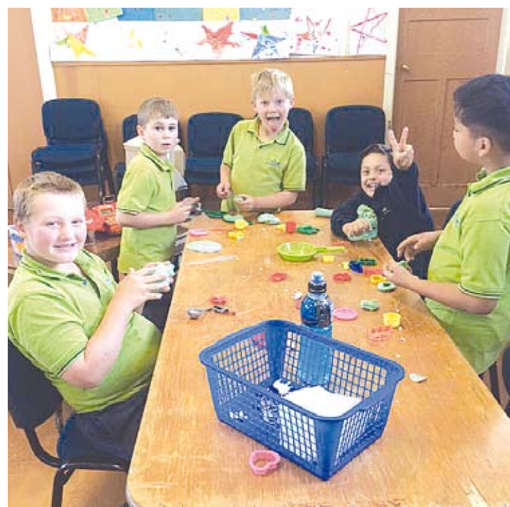
Kids Alive Geraldine caters for children from Geraldine, Woodbury, Winchester and Carew Peel Forest schools.

Kids Alive Geraldine caters for children from Geraldine, Woodbury, Winchester and Carew Peel Forest schools. Not only will the children have nowhere to go after school, but the five staff members who supervise the children on a day-to-day basis will lose