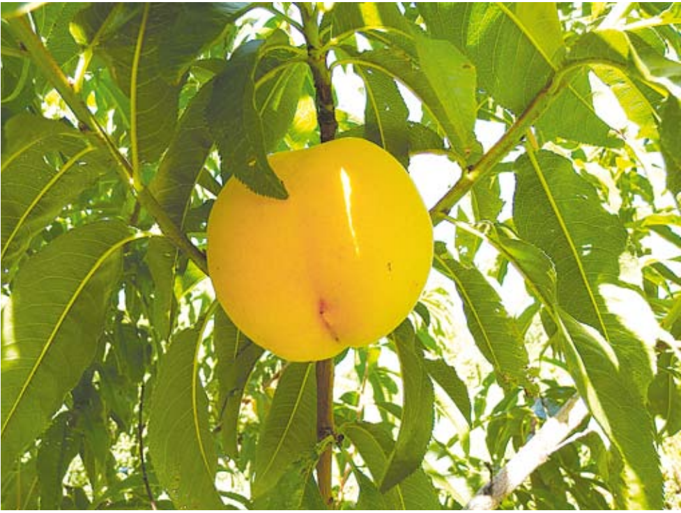
The Golden Queen Peach: A hardy stone fruit which grows well in our climate and is very tasty eaten straight from the tree.

It's real food and real life experiences like these you can't buy. If you're new to gardening, fruit trees are a great place to begin. They're low maintenance with high yields and they don't cost the earth. You can create your own fruit tree for as little as $4.50 by purchasing rootstock and grafting it yourself. Some trees will happily grow from seed, Blackboy