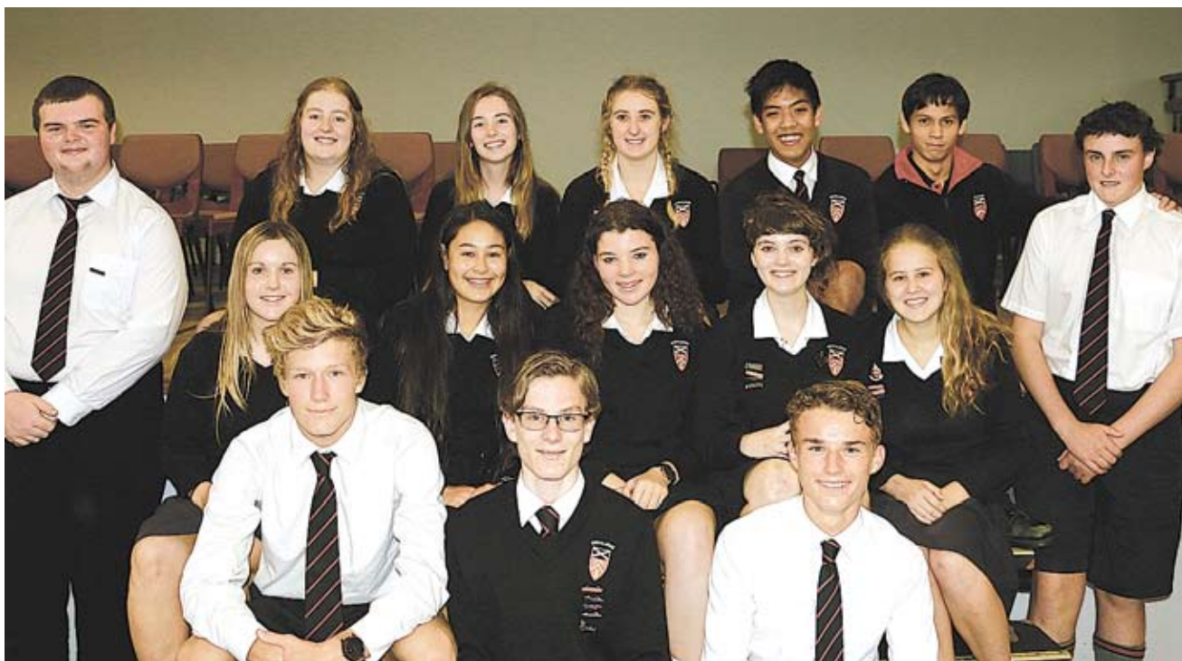
Geraldine High School's students who achieved an excellence pass in NCEA Level 1 in 2015.

Geraldine High School (GHS) invited parents and friends to celebrate the academic success of its NCEA students at a special assembly last week. Thirty-six NCEA students at GHS passed the 2015 year with excellence and received academic blues awards at the assembly.