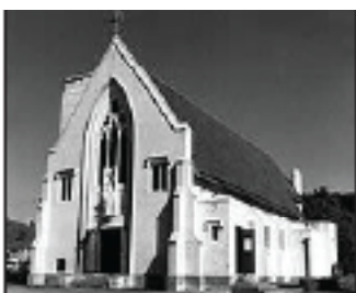
Geraldine Parish room