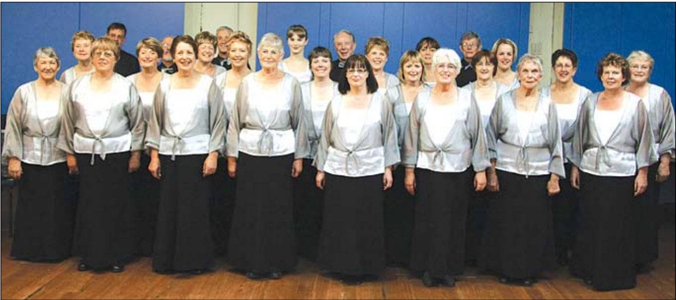
The Mid-Canterbury Choir meet weekly at the Ashburton Events Centre.