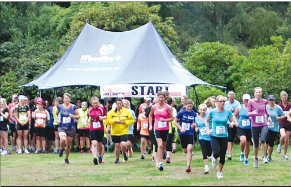
The first group of runners take off in the Woodbury Women's Duathalon.

At the start/finish line in the Woodbury Domain a great