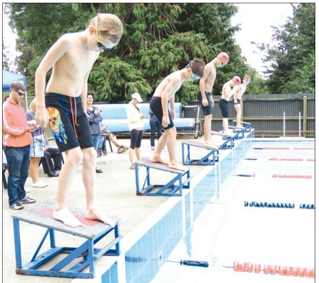
Year 5 boys get ready to race 50m breaststroke.