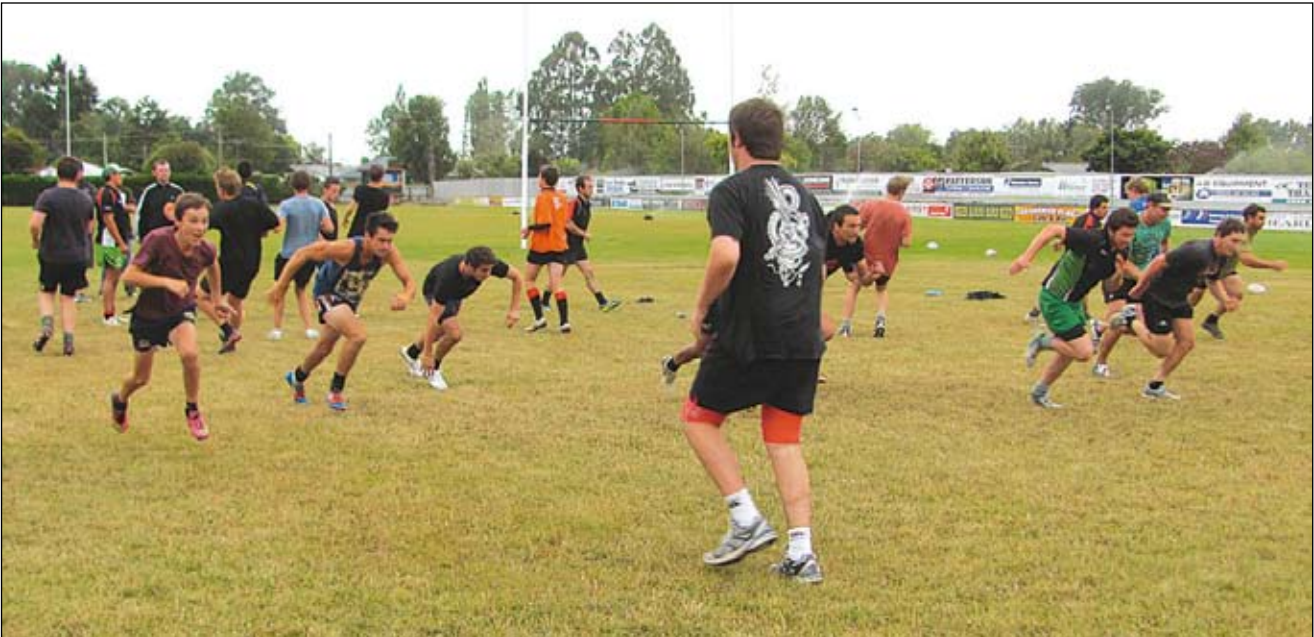
Pre-season rugby training for the Geraldine Rugby Club is well underway for the 2015 rugby season. Training sessions are held on Monday and Thursday evenings at 7pm at the Raukapuka rugby grounds and any interested players from all age groups are welcome to come along and join in.