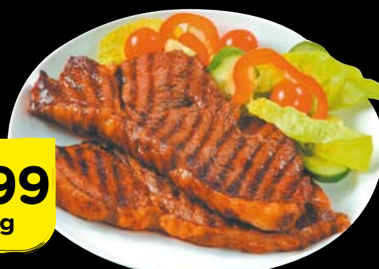
Fresh NZ Beef Rump Steak