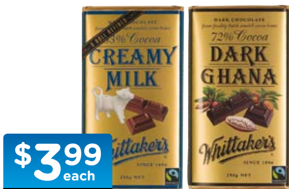
Whittaker's Chocolate Block 250g