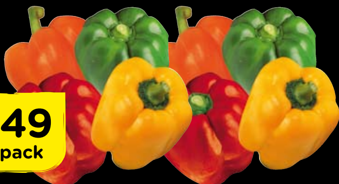
NZ Gourmet Coloured Capsicums 4 Pack