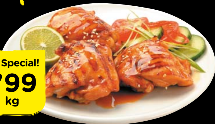
Fresh Tegel NZ Premium Chicken Thigh Cutlets