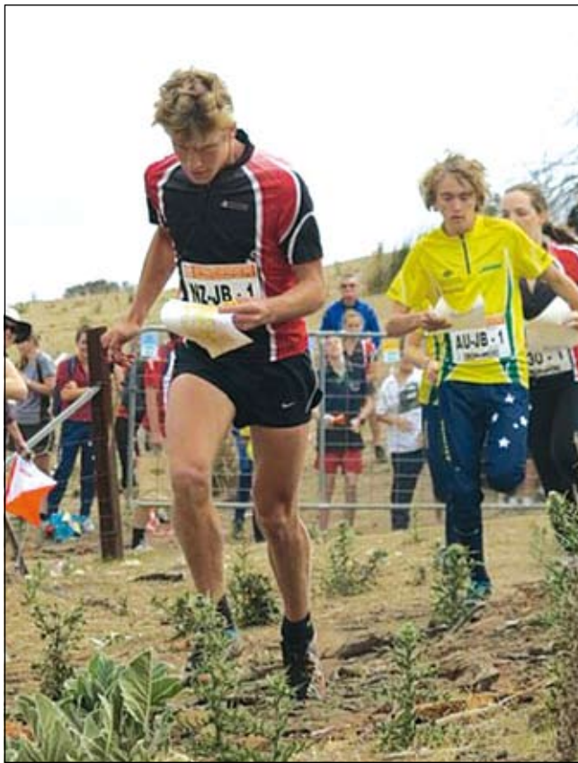
This is a photo of me in the schools challenge relay, running for New Zealand Junior Boys, we placed 1st in this event.