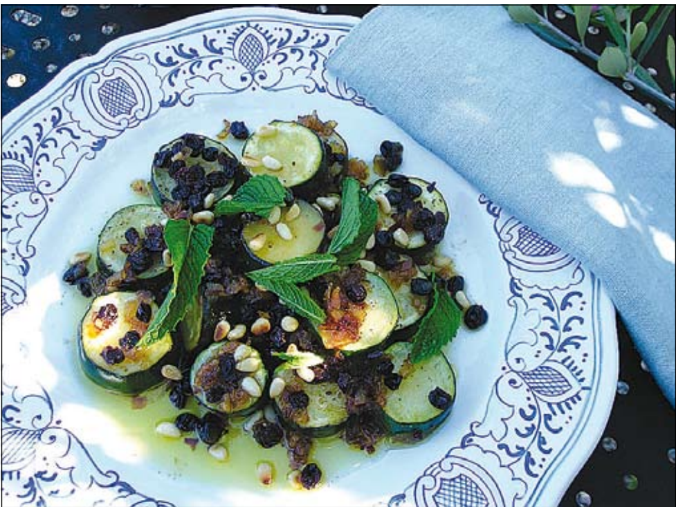
Sweet and sour zucchini.

Line a cake tin with baking paper. Heat the oven to 170°C. Cream the butter with the sugar and the vanilla until light and fluffy. Add the eggs one at a time, along with one tablespoon of the flour. Sift in the dry ingredients and fold in with the yoghurt and zucchini. Turn into the tin and bake for about 45 minutes. Ice with chocolate frosting.