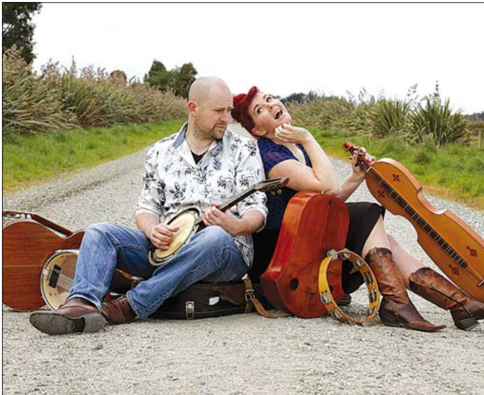
Into the East will perform in Ashburton and Fairlie in mid February.