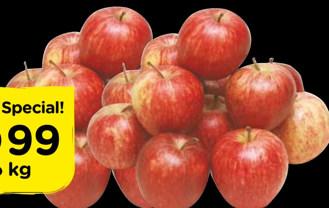
First Of The Season NZ Royal Gala Apples