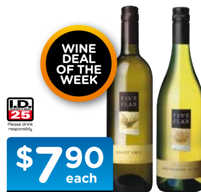
Five Flax 750ml