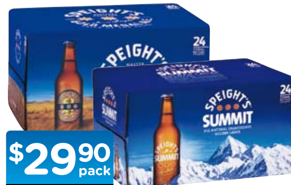
Speight's/Summit 24 x 330ml Bottles

Prices apply from Thursday 5th February to Sunday 8th February 2015, or while stocks last.