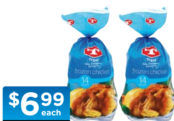
Tegel Frozen Chicken No 14