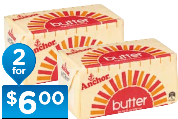
Anchor Butter 500g