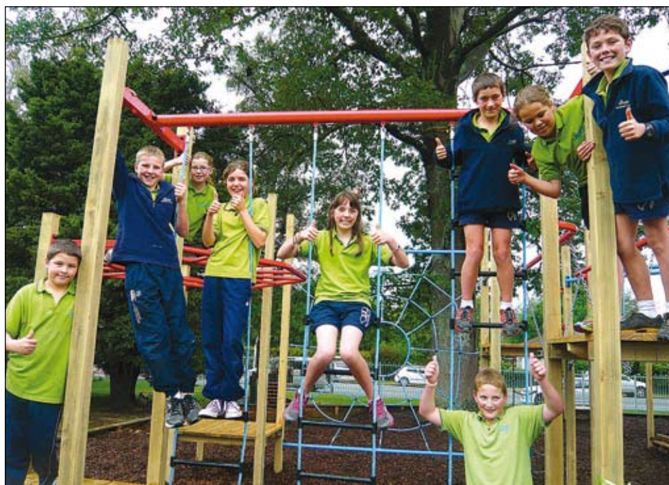
Year 6 students approve the new playground, "There are more places to play and more things to climb."

community have come together and provided a wonderful facility. This playground will be a wonderful space for our children and the community to enjoy."