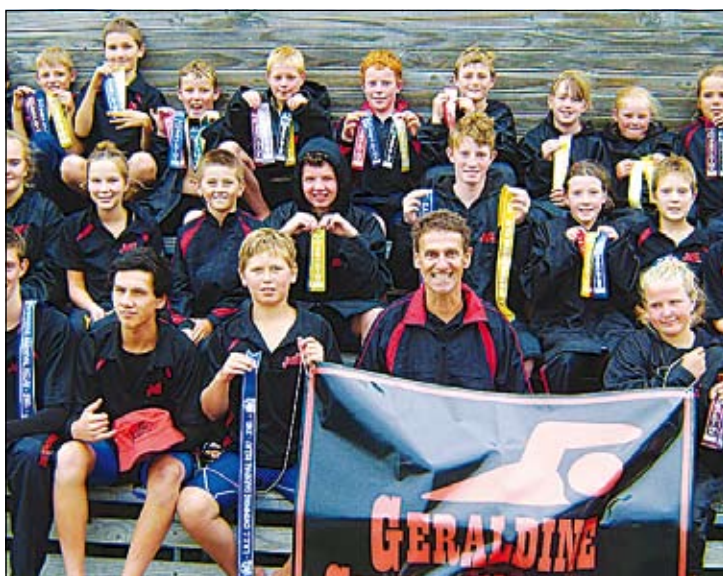
Swimmers at the Geraldine Ribbon Day event.

The Geraldine Amateur Swimming Club was thrilled with their annual Ribbon Day Carnival event, held at the Geraldine pool in January. Twelve clubs from around the Canterbury/West Coast region entered, swelling the numbers of swimmers at the event to more than 150.