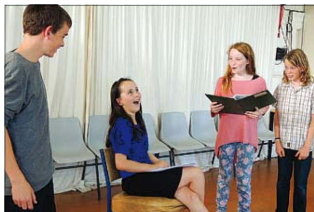
Speech and drama students practise their lines.