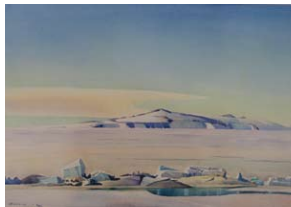
AA DEANS | Antarctica